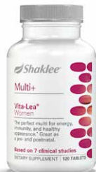
VITA-LEA® THE PREMIER MULTIVITAMIN

Choose your Multi+ and Protein, the Building Blocks for Life.