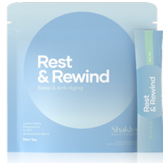
Rest & Rewind