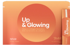
Up & Glowing