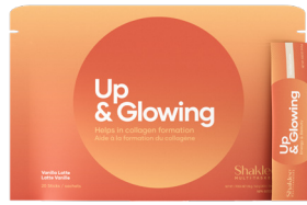
Up & Glowing