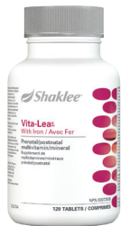
VITA-LEA® THE PREMIER MULTIVITAMIN

Choose your Multi and Protein. The foundation for a healthier life.