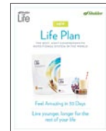
Life Plan consumer brochure