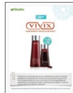
Vivix® consumer brochure