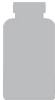
Key Ingredient in a Leading Brand