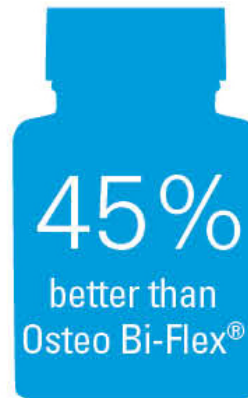
Joint Health Complex Key Ingredient