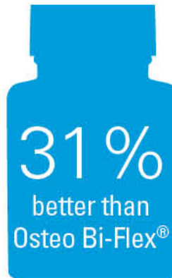
Joint Health Complex Key Ingredient