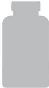
Key Ingredient in a Leading Brand